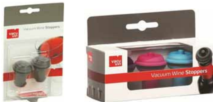
Wine Stoppers Gray - 2 per card 7771 (12) Wine Stoppers Gray - Bulk, (Bag of 10) 7773 (1) Stoppers - Set of 3 (Pink, Blue & Purple) 7774 (6)