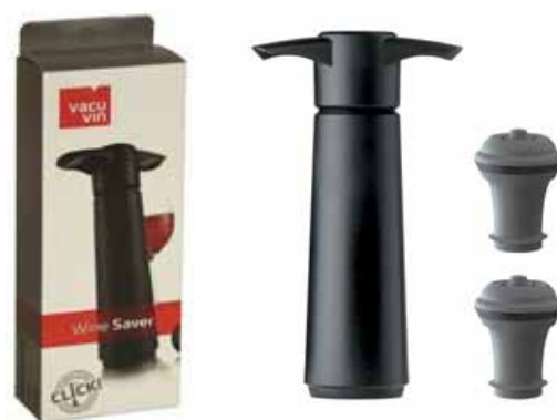
Wine Saver Gift Pack - Black pump with 2 stoppers 7772 BLK (6)