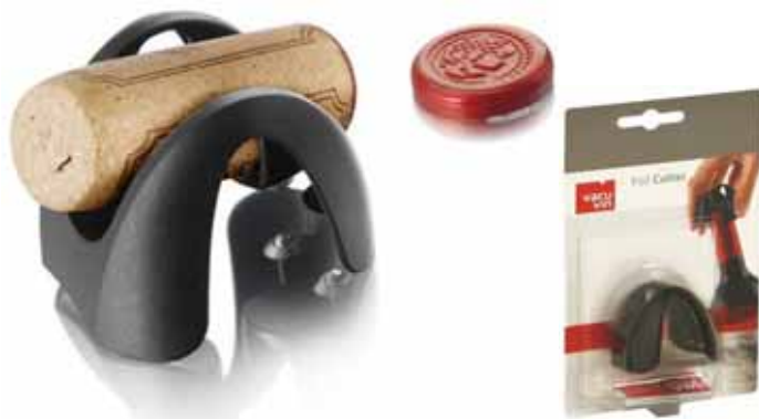
Foil Cutter - Four stainless steel knife edges remove protective foil simply and neatly. V685446 (6)