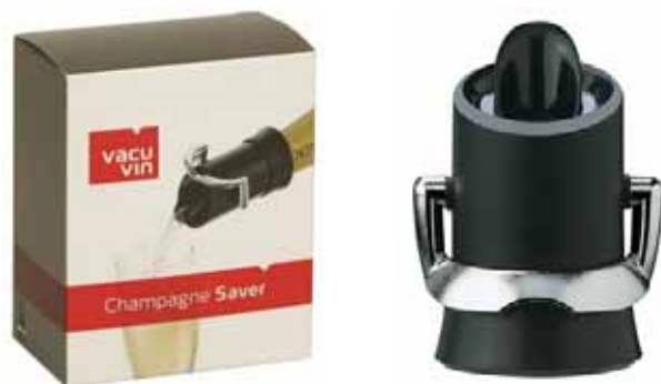
Champagne Saver & Pourer 7830* (6)