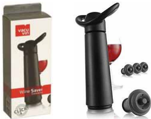
Concerto Wine Saver - Black pump with 4 stoppers 7775 (6)