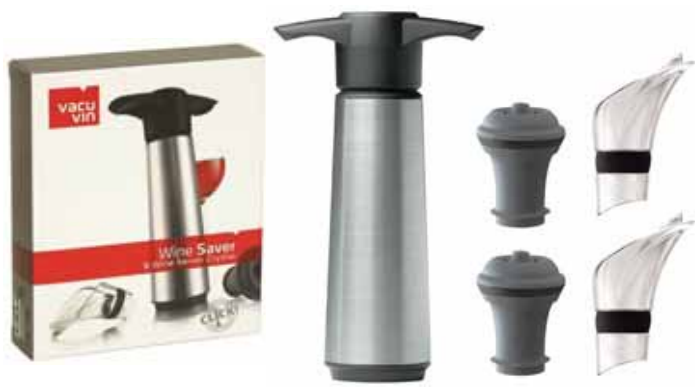
Stainless Steel Wine Saver Set - 1 pump with 2 stoppers & 2 Crystal Servers V649360* (6) *Special Order