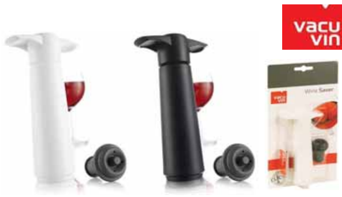
Wine Saver - Black or White pump with 1 stopper on blister card. 7770BLK or 7770WHT (6)