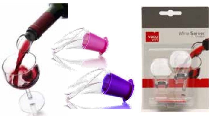
Wine Server Crystal - 2/card, Black 7777* (12) Wine Server - 2/card (Pink & Purple) V1854151* (12)