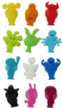
Set of 12

Glass Markers - Party People V188605* (6)